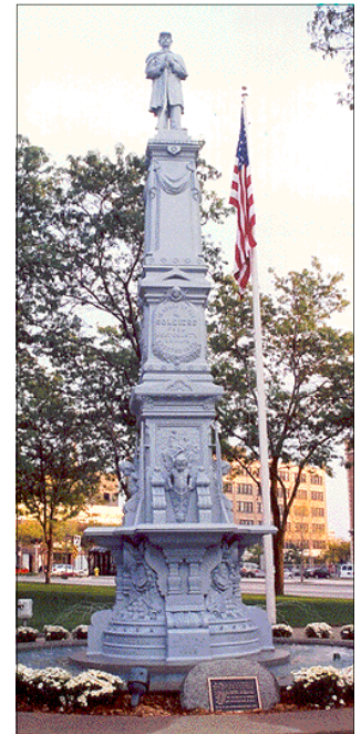
The Kent County monument after its $250,000 restoration.