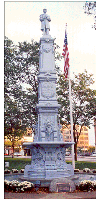
The Kent County monument after its $250,000 restoration.