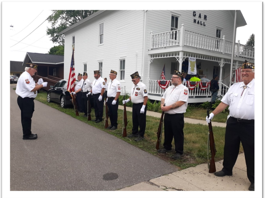
Boscobel VFW Post Honor Guard prepares for 21 gun salute.

Future memorial ceremonies will be held in the future as arrangements to honor other Grant County Gold Star Families can be arranged.