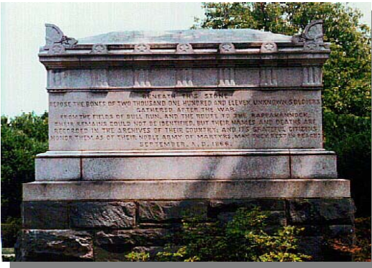
Tomb of the Civil War Unknown Dead at Arlington National Cemetery.