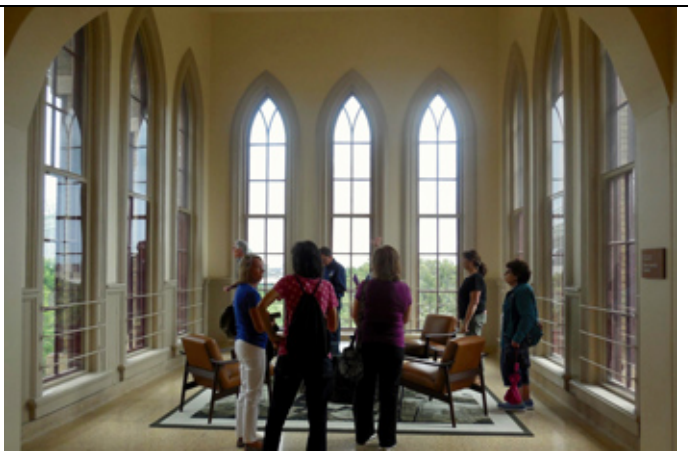
Old Main and its striking windows now are better than ever.

The Zablocki VA Medical Center will provide case management and supportive services. All residents will have access to on-site help such as peer-to-peer counseling, benefits assistance, education training, employment assistance and sobriety maintenance.