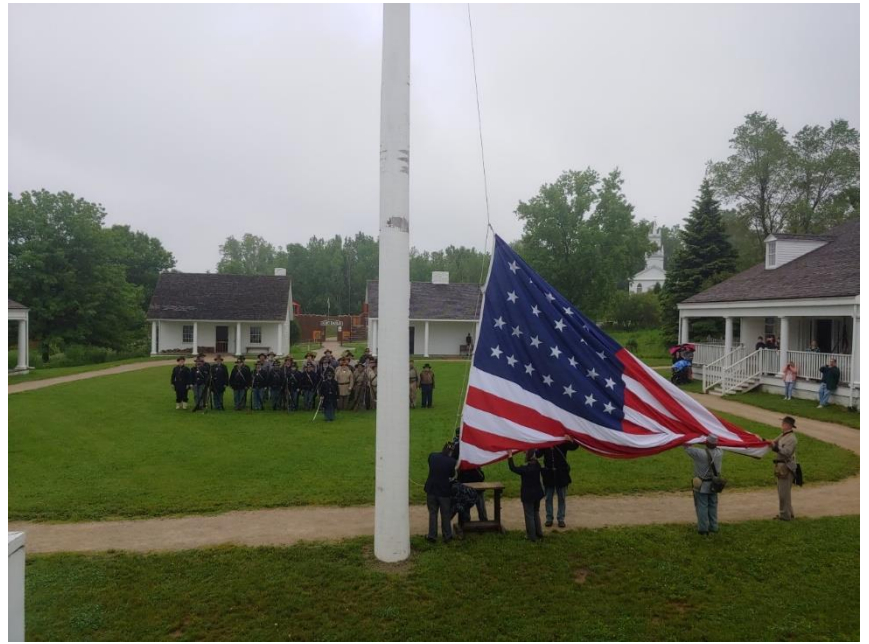
Flag raising at Heritage Hill Civil War Weekend.