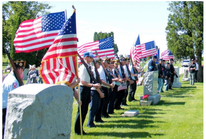
Last Soldier of Grant County dedication from the Department Encampment in Boscobel.