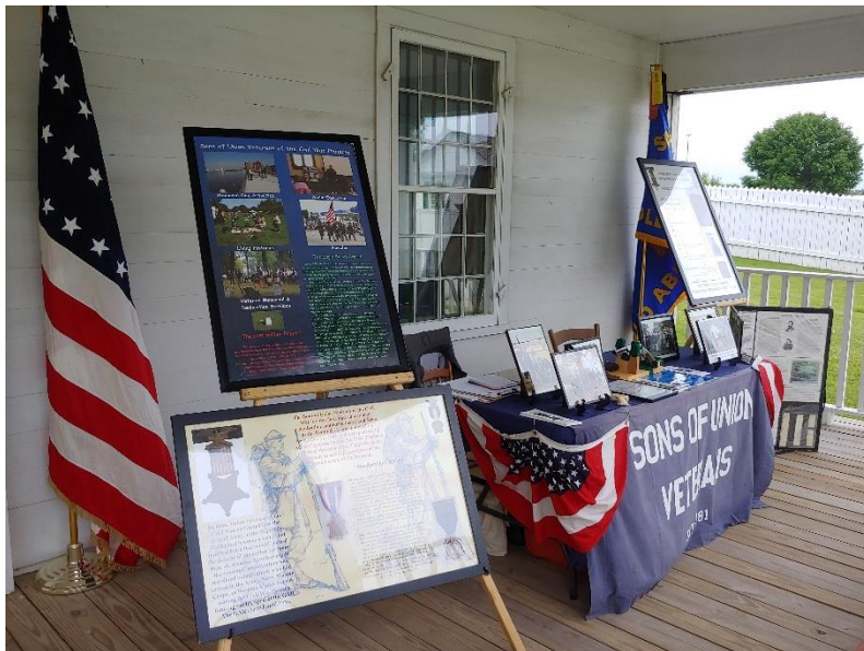
Camp Booth at Heritage Hill State Historical Park Civil War weekend June 23rd & 24 th