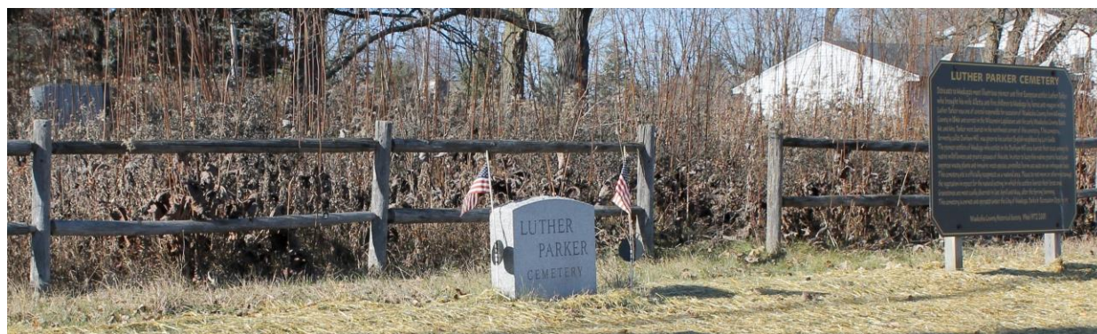
Weeds in Luther Parker Cemetery so high, most of the tombstones cannot be seen.