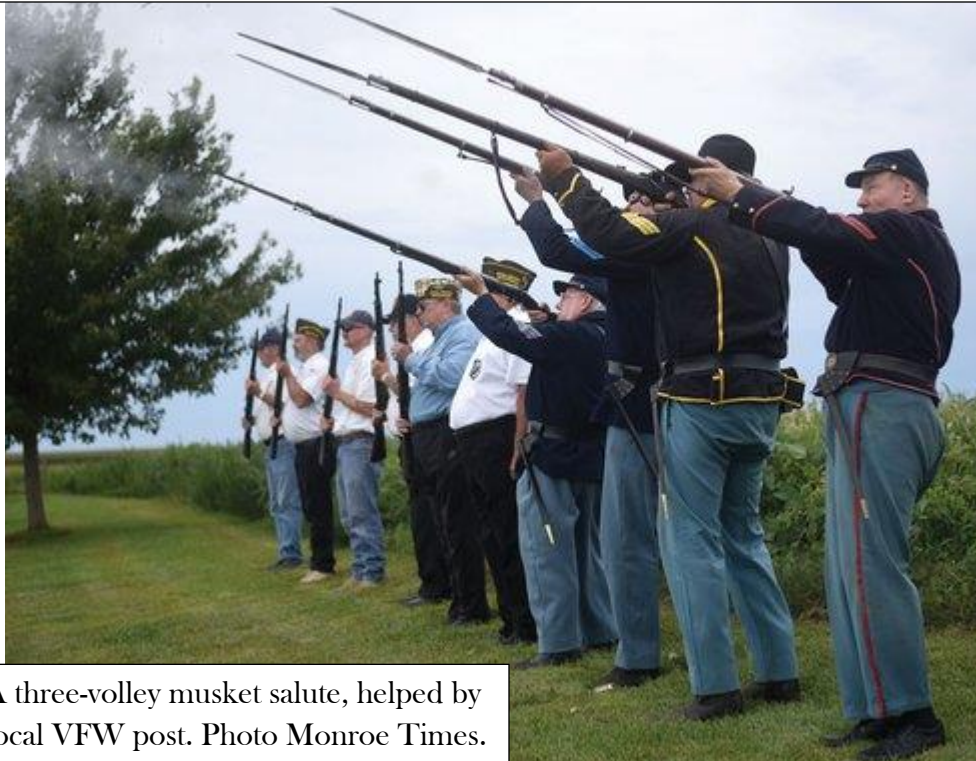
A three-volley musket salute, helped by local VFW post.