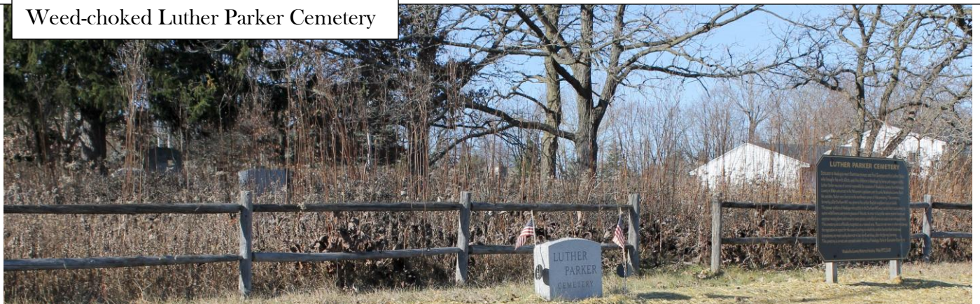
Weed-choked Luther Parker Cemetery