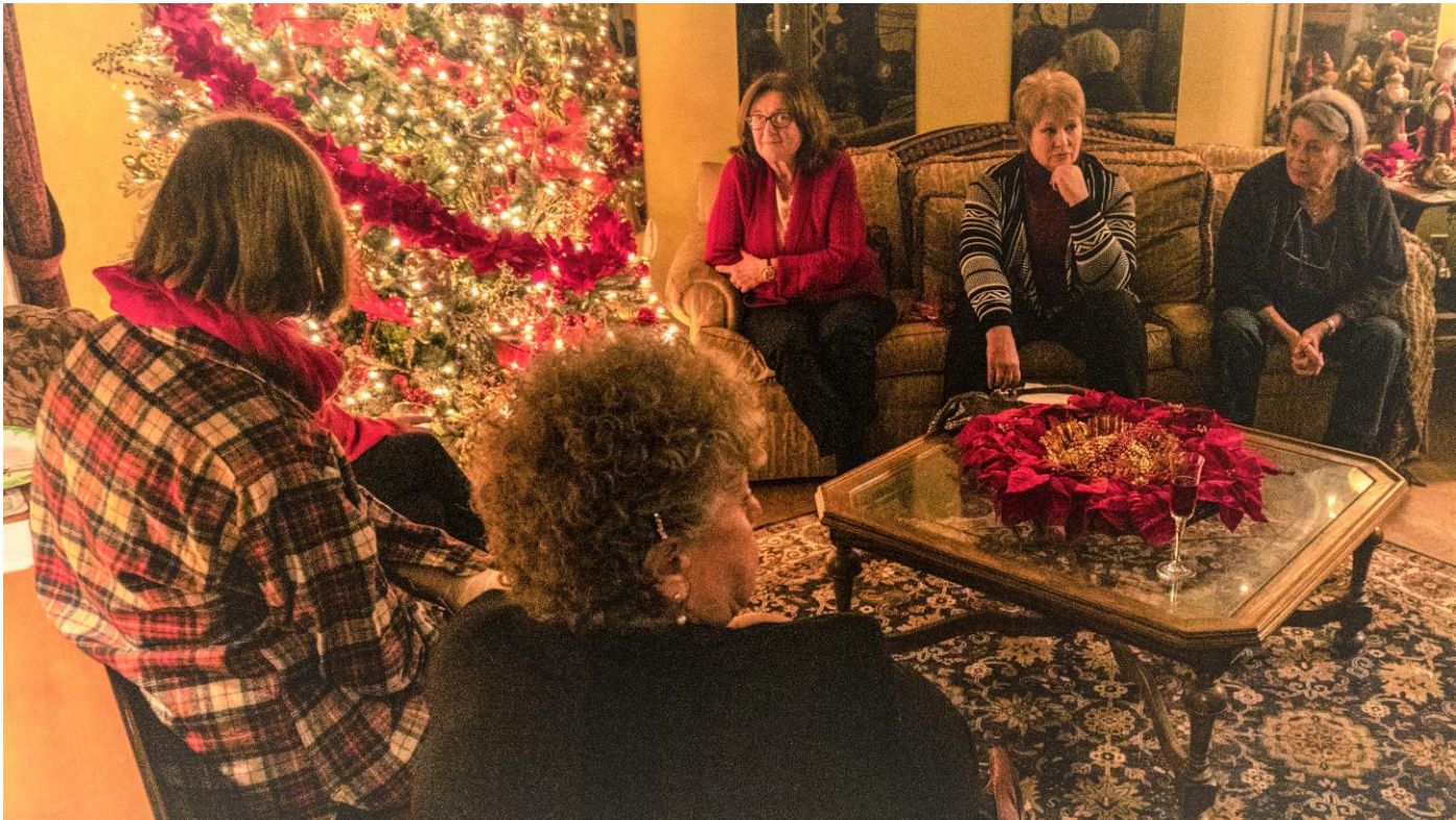
Five ladies of Camp #15 discussing the great events of the day. By party’s end, these five had all the world’s problems solved. All right, ladies - we’re all waiting to hear the solutions you’ve come up with...